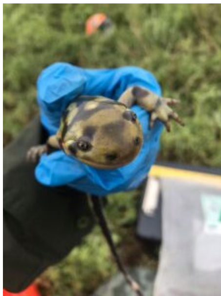
(A researcher holds a Barred Tiger Salamander, a resident of Texas playa wetlands.)

Researchers say the pesticide concentrations found were toxic to two invertebrate species found in playas. Invertebrates are often used as “bioindicators” the health of other animals in an ecosystem. Since other wildlife rely on playa invertebrates for food, the toxic effects could eventually impact the stability of the whole playa ecosystem.