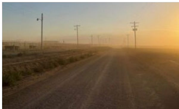
(Dust hangs in the air near a cattle feedlot in northwest Texas.)