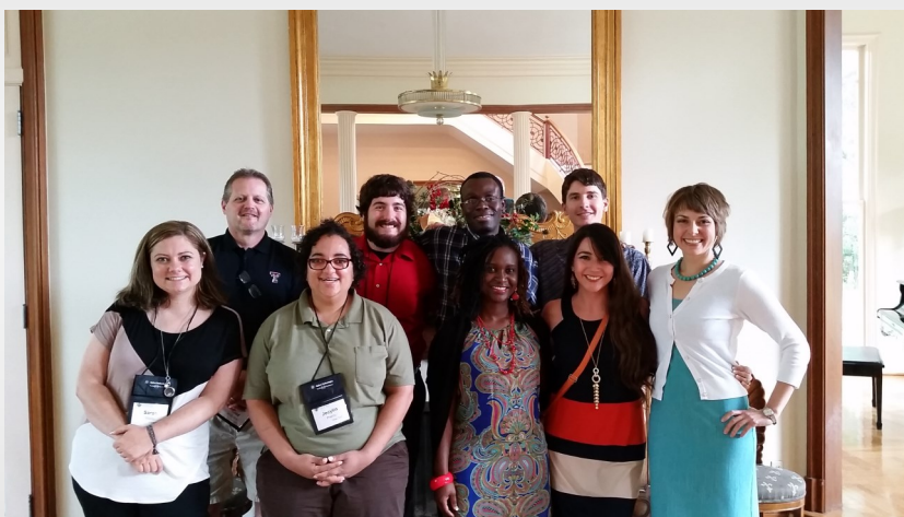
SETAC South Central Regional Meeting

The Institute of Environmental and Human Health (TIEHH) and Department of Environmental Toxicology