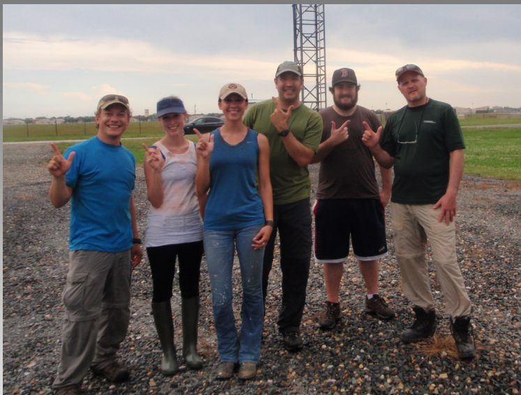
Sampling the bayou near Barksdale Air Force Base