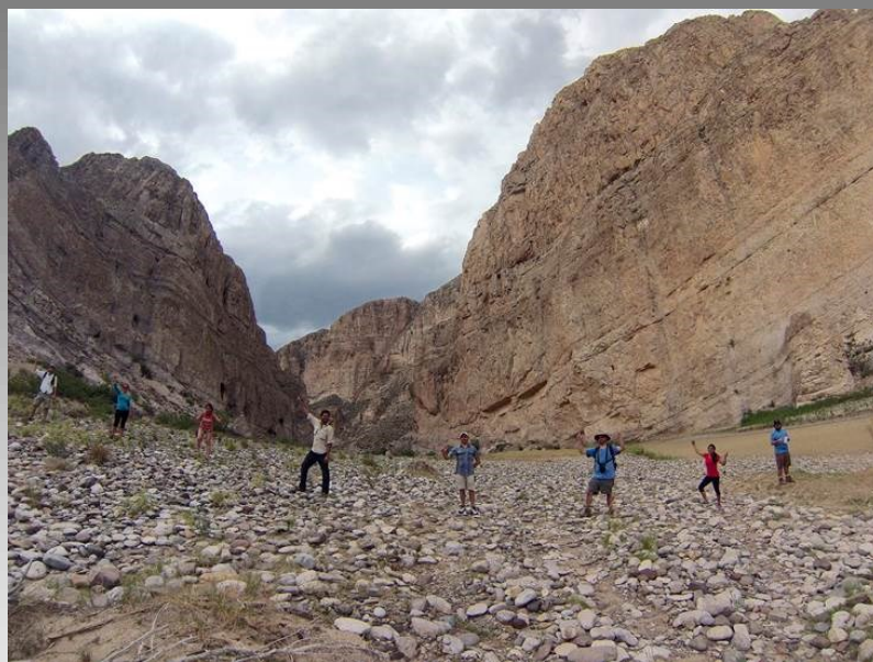
Student retreat at Big Bend National Park