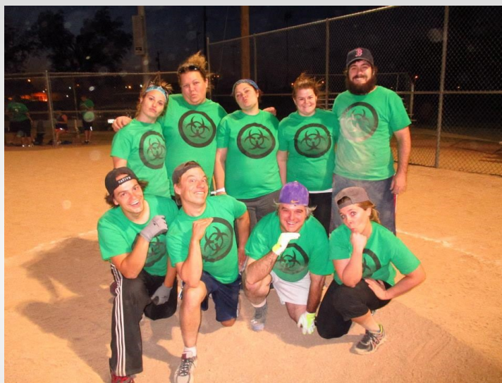
Toxic Balls Kickball