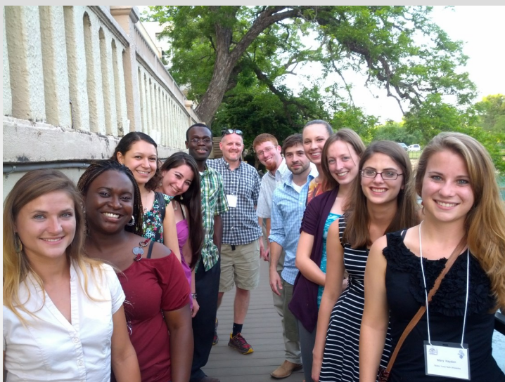
From the Regional SETAC Meeting in San Marcos, TX